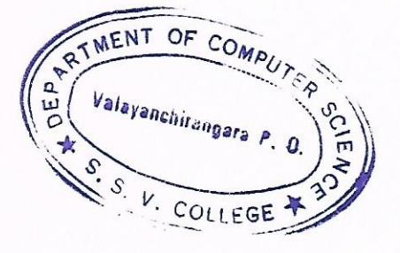
Department of Computer Science S S V College, Valayanchirangara

The academic year 2020-2021 tested the resilience and adaptability of the Computer Science Department. Our response to the challenges, driven by stakeholder feedback, not only addressed immediate concerns but also strengthened our capacity for remote education and student support. As we move forward, these experiences will inform our strategies to ensure robust and flexible educational offerings.